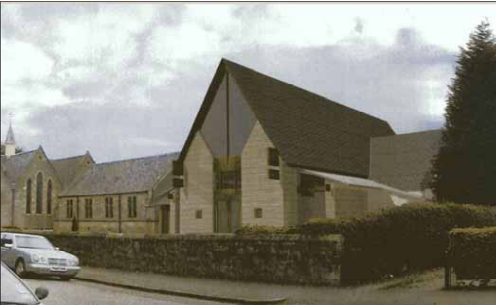
An impression of the finished building

Mindful also of the need to conserve energy, the new hall will be heated by a ground source heat pump, which will extract heat from four boreholes, each 90